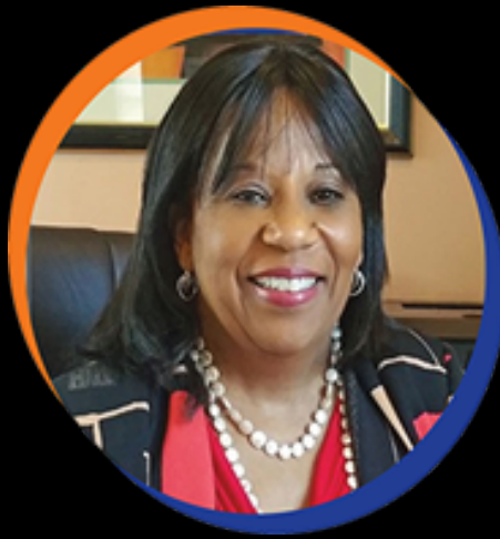
CEO & Publisher